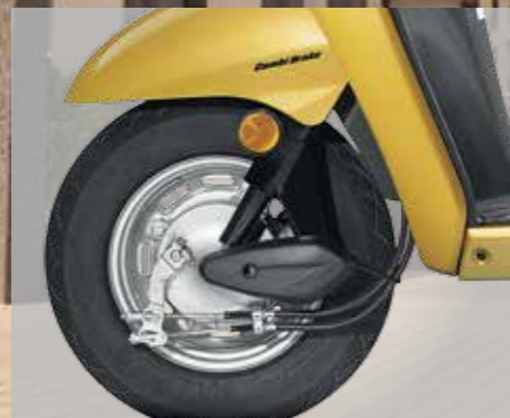
CBS WITH EQUALIZER Honda's technology not only offers you great rides, but optimum braking too which helps improve stability.