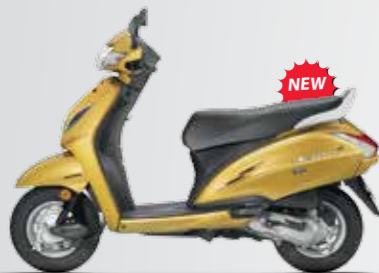
DAZZLE YELLOW METALLIC