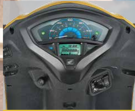
DIGITAL ANALOG METER WITH ECO SPEED INDICATOR ^ Digital analog meter helps indicate precision riding.