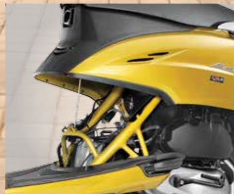
CLIC MECHANISM This outstanding mechanism helps you lift up the entire rear body cover. So not only riding, even servicing is easy with Activa 5G.

From generation to generation, India's love for Activa is growing deeper. The legacy continues with the new Activa 5G.