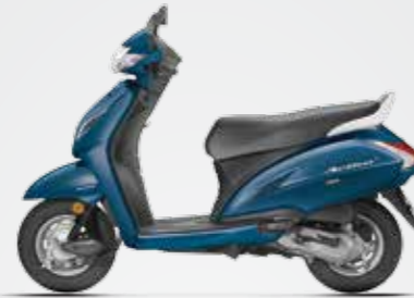
TRANCE BLUE METALLIC