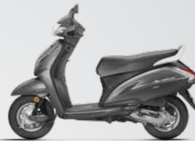
MATTE AXIS GREY METALLIC