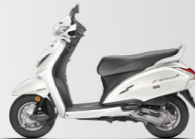
PEARL AMAZING WHITE