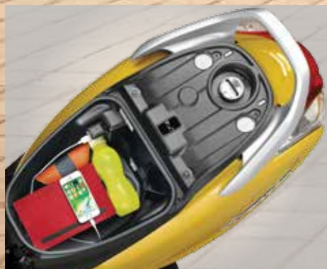
18L UNDERSEAT STORAGE WITH MOBILE CHARGING SOCKET* Carry every little-big thing you need when you ride on an Activa 5G. Even power for your mobile with a charging socket under your seat.