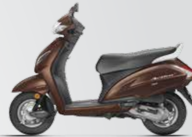
MAJESTIC BROWN METALLIC