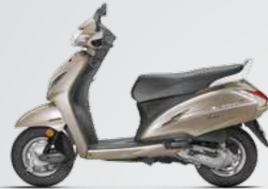
MATTE SELENE SILVER METALLIC