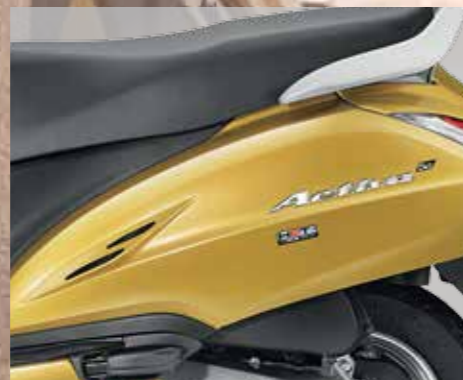
FULL METAL BODY AND PREMIUM 3D EMBLEM No matter what condition you ride in, you can rely on Activa 5G's full metal body with confidence.