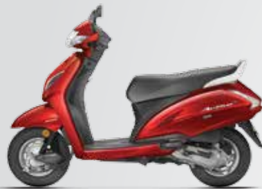
PEARL SPARTAN RED