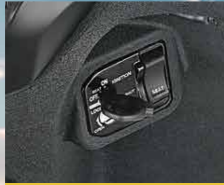
4-IN-1 LOCK WITH SEAT OPENING SWITCH Convenience at your fingertips with a smart seat opening switch provided at the front.