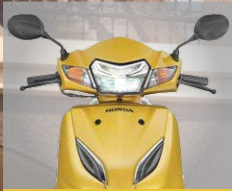
LED HEADLAMP AND POSITION LAMP Leave everyone awestruck with the new LED position lamp and headlamp that together shine like a crown. Ride brighter with Activa 5G.