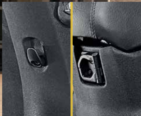
NEW FRONT HOOK AND RETRACTABLE REAR HOOK Carrying handbag? Hang it by the front hook. Have another bag with goodies? Put it up by the rear hook made retractable for more convenience.