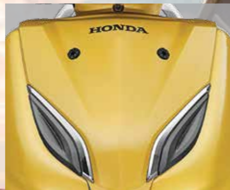
ELEGANT CHROME GARNISH It's simple, it's stylish and it will get the maximum attention on roads. Activa 5G's elegant front is the first impression you want to make on the world.