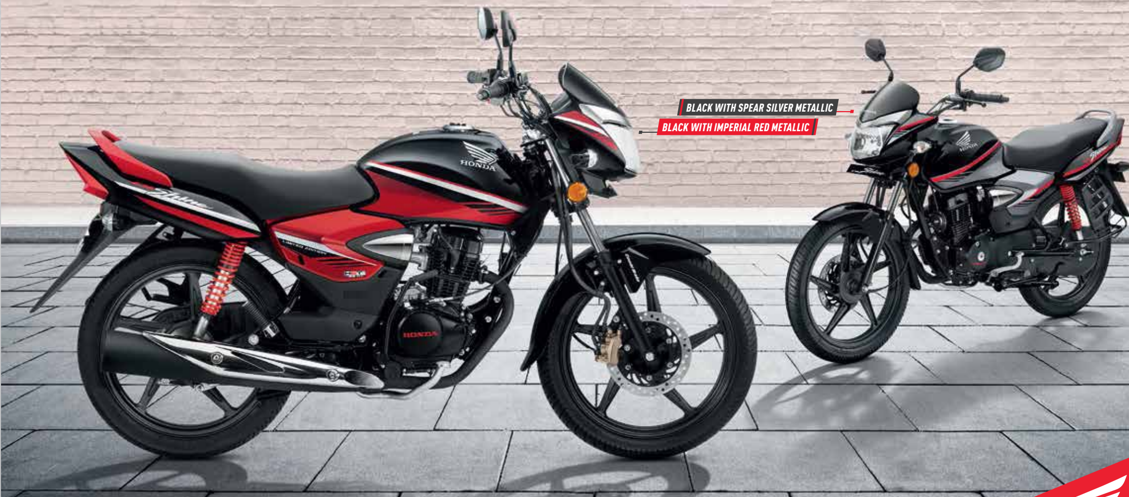
BLACK WITH SPEAR SILVER METALLIC BLACK WITH IMPERIAL RED METALLIC